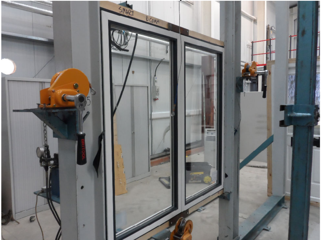
Photo of sample